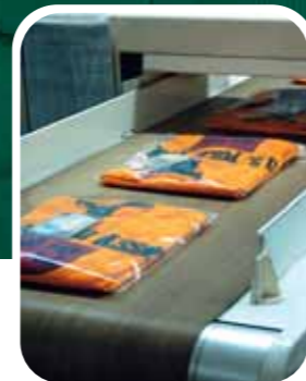
Metal Detector Machine